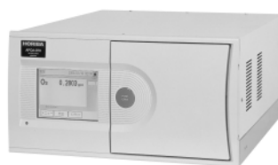
O 3 Analyser