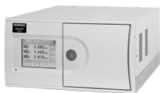
NO x Analyser