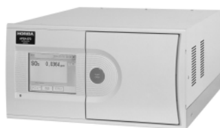
SO x Analyser