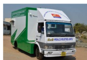
Station & System