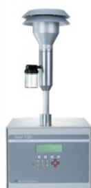
PM 10 Analyser